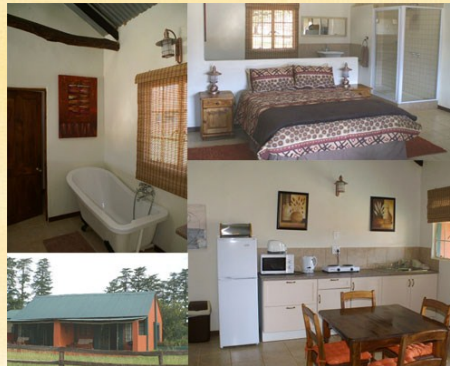
Loerie and Lilac Studios (2 PEOPLE SHARING EACH)