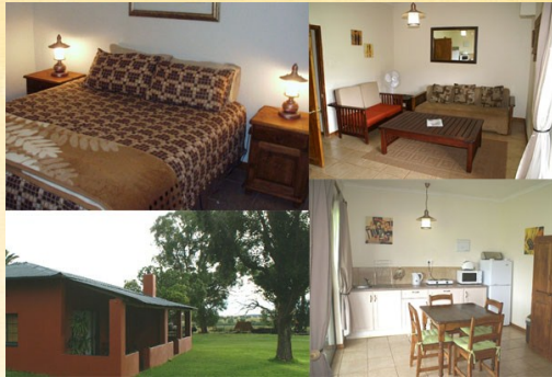
Peacock and Lavender Cottages (4 PEOPLE SHARING EACH)